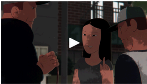
EN NUESTRAS COMUNIDADES, EN NUESTRAS CALLES