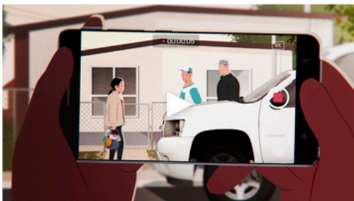
CÓMO DOCUMENTAR ARRESTOS DE ICE