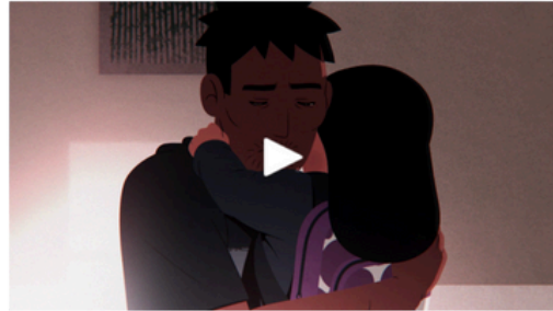
DENTRO DE NUESTROS HOGARES