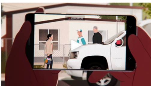
WHEN DOCUMENTING ICE ARRESTS